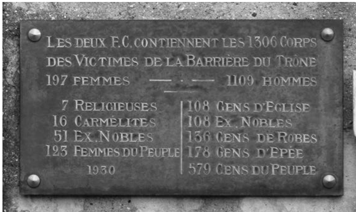
Plaque at the entrance to the field of common graves at Picpus Cemetery.

My inspiration for the production comes from the source. Long ago, I made a solemn visit to the Picpus Cemetery on Rue de Picpus in Paris, where the 16 Carmelite nuns, our protagonists, were interred in an open grave after their atrocious beheadings at the Place de la Nation in 1794. Parisians witnessed one of the worst excesses of Robespierre's Reign of Terror during this time that followed the French Revolution. The sisters' only "crime" was holding fast to their religious beliefs. Their memorial is located in the back of the cemetery, ironically near the grave of the American General Lafayette who fought in both the French and American Revolutions. His gravesite is dirt from the Battle of Bunker Hill, and it is actually American land; interestingly, our flag flew on the site all during World War II. Horrifically, we all know this kind of genocide still happens. One can hope this offering of art helps people reflect on our world today.